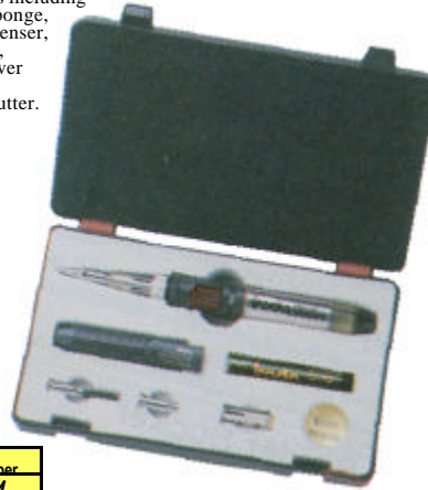
Part Number T2601

The T2601 kit comprises the IRODA T2600 Gas Soldering Iron supplied in a handy carry case with a range of tips and accessories including cleaning sponge, solder dispenser, blow torch, hot air blower and hot knife cutter.