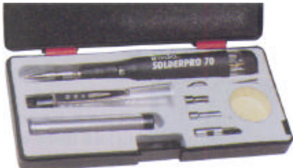
Part Number T2592

The T2592 kit comprises the IRODA Gas Soldering Iron supplied in a handy carry case with a range of tips and accessories including safety stand, cleaning sponge, solder dispenser, blow torch, hot air blower and hot knife cutter.