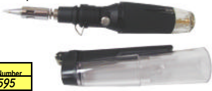
Part Number T2595

The advanced IRODA Soldering Iron offers go-anywhere soldering convenience with an equivalent heat capacity of up to 50 Watts. It features an adjustable heat control, cap mounted flint igniter, long life catalyst tip and a huge gas reservoir for up to 1 hour use.